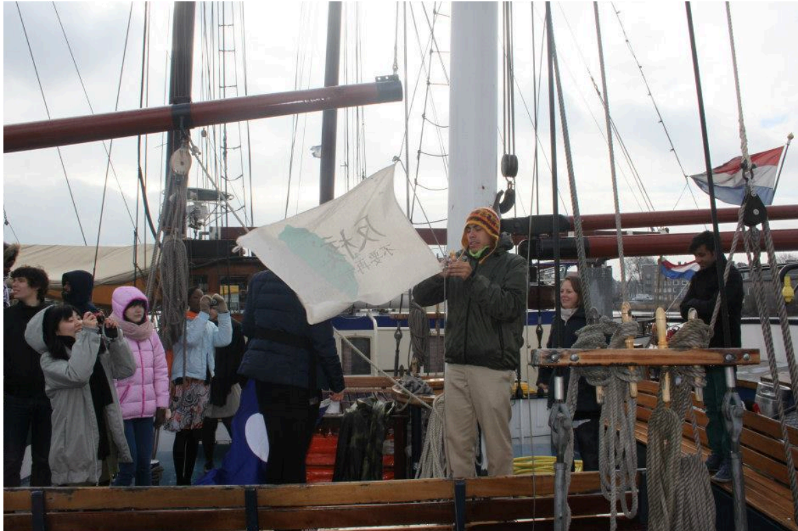
Tuesday 19 March, hoisting a flag in the morning after a round of reflections of output and process evaluation of the day before

The second phase started arriving at the sleeping ship 'De Vliegende Hollander' in the Houthaven harbor in Amsterdam. This stimulating sleeping and meeting venue reminded us of the water continuously. Inside the slowly rocking ship, we estimated how much water the group as a whole would use during the 4-day preparatory program (outcome: 7600 liters), cooking and washing. As all water came from a tank, we were asked by the skipper to use water with moderation. The fresh air at the deck energized, and after a full program day, we hoisted a flag to celebrate the output.