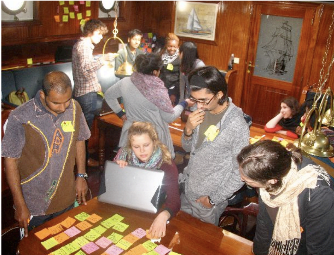
Working on the formulation of the Guideline for Water Cooperation in breakout groups at the ship De Vliegende Hollander

ANNEX: Program Schedule; List of Participants; Guideline for Water Cooperation